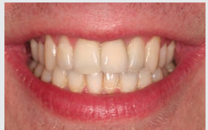
Figure 18 —Three weeks after delivery of bridge; smile view.

embrasure. 5 In a prosthesis involving a pontic, the papilla can be 6.0 mm to 9.0 mm above the crest of the interproximal bone on the adjacent teeth. 6 A reliable average is 6.5 mm of papilla height when a pontic is used. 7