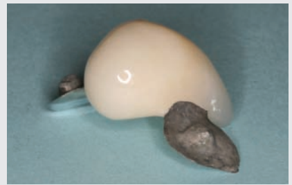
Figure 15 —Bridge; note smooth biconvex contours of tissue side of pontic.