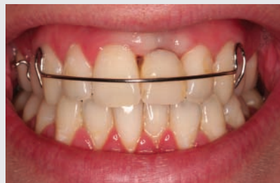
Figure 5 —Initial placement of denture tooth into pontic site after electro-surgical contouring of soft-tissue graft; note slight blanching of gingival.