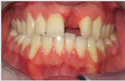
Figure 1 —Retracted view after orthodontic alignment of tooth No. 10 and before connective tissue graft.