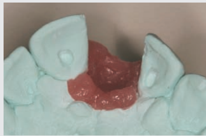
Figure 14 —Lab model with simulated soft tissue; note conservative preparation for bridge at gingulums of incisors only.