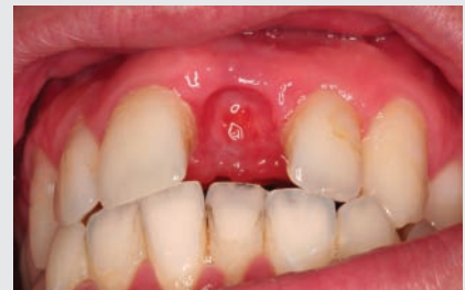
Figure 12 —Close-up of pontic site; note bi-concave contours.

was shaped to angle the gingival-facial surface toward the palate and acrylic was added to slightly widen the tooth at the papilla level. These adjustments gave the central incisors similar gingival heights and provided more support for the papilla.