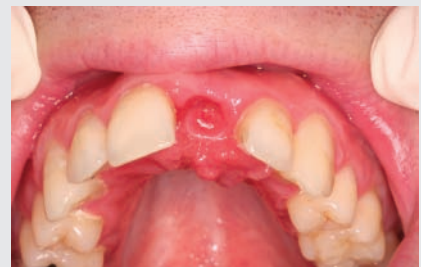
Figure 6 —Healing of pontic site after initial tissue contouring.

Resin bonded bridges have had a reputation for unreliability because of debonding 2 ; however, proper case selection is essential to ensure success with this type of prosthesis. The patient met all the requirements for a Maryland bridge, including short span, anterior location, adequate clearance, lack of deep overbite, immobile teeth, adequate enamel, and lack of parafunctional habits.