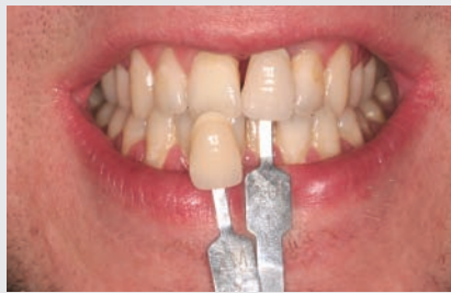
Figure 13 —Shade taking for bridge with Vita 3D tabs.