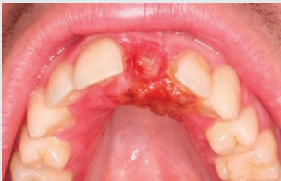
Figure 10 —Final electro-surgical contouring of soft tissue at pontic site and on palate.