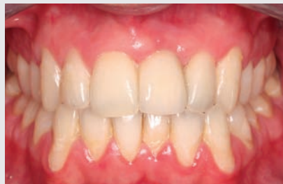
Figure 17 —Three weeks after delivery of bridge; retracted view.