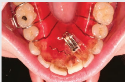
Figure 4 —Interim removable partial denture in place.