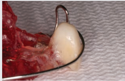
Figure 8 —Additional shaping of denture tooth with acrylic (side view).