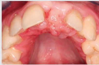
Figure 2 —After connective tissue graft in the area of tooth No. 9.