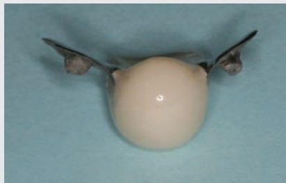
Figure 16 —Bridge; note retentive extensions on wings of pontic.