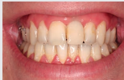
Figure 11 —Final maturation of tissue around interim pontic.