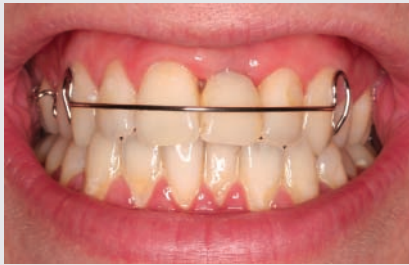
Figure 7 —Healing complete after initial soft-tissue contouring; denture tooth and gingival need additional shaping for esthetics.