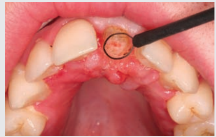
Figure 3 —Electrosurgery recontouring of pontic site.